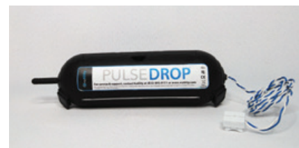
Sample Water IoT Sensor 10" x 7.2" circum ( Vutility )