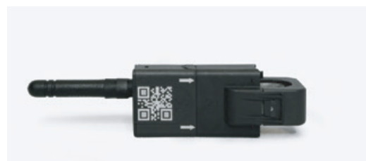
Sample Electricity IoT Sensor 2" x 1" x 0.4" ( Vutility )