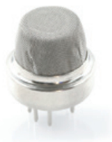
Sample Methane IoT Sensor 2" x 1.5cm x 1.5cm ( Sparkfun )